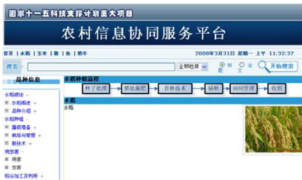
Fig.3: Rice cultivation pages

Research in rural information service platform on the basis of key technologies, selects rice planting, cultivation industry in cows, pigs and fish several other business themes, while the selected topic group in the two new agricultural expert systems, seven famous agricultural information systems and expert systems as the resources of platform, according to the research of key technologies referred to in the packing technology, the resources of the packing layer pack and publish into Web Service, which are called by the performance layer, the initial realization of a rural information service platform which can provide business information to the user's query, picture presentation, diseases and insect pests of judging and processing and administration of veterinary drugs. As shown in Fig.3 for rice cultivation of the page.