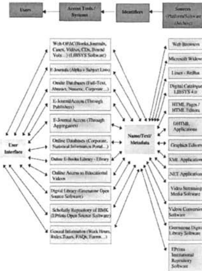
Fig2. Content/information integration model of DL portal

research is required on a larger scale to gather data from every university of LIS and computer science in order to update and extend our findings. We need to develop good models of DL educational programs and courses, and a greater synergy between DL research and education. Finally, we need the resources to develop and sustain an expanding and far reaching program of DL education.