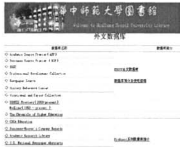
Fig3. Library Portal interface frame of DL HNU