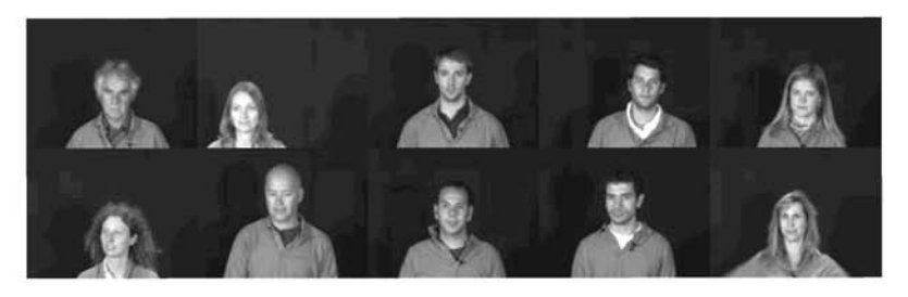
Fig. 1. The participants who took part to the recordings.

Ten participants of the summer school distributed as evenly as possible concerning their gender (Figure 1) participated to the recordings. Subjects represented five different nationalities: French, German, Greek, Hebrew, Italian.