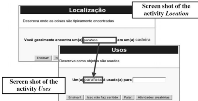
Figure 1. Example of the OMCS-Br feedback process

Those templates have a static and a dynamic part. The dynamic part is filled out by a feedback process that uses part of sentences stored in the knowledge base of the project to compose the new template to be presented. Figure 2 exemplifies how the feedback process works. At the first moment the template "You usually find a _____ in a chair " of the activity Location is presented to a contributor – the templates bold part is the one filled out by the feedback system. In the example, the contributor fills out the sentence with the word "screw". Then, the sentence "You usually find a screw in a chair" is stored in the OMCS knowledge base. At the second moment, the template "A screw is used for _____" of the activity Uses is shown to another contributor. Note that the word screw entered at the first moment is used to compose the template presented at the second moment.