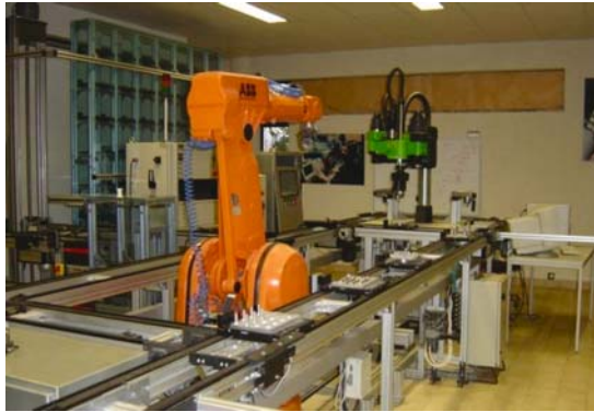
Figure 2. The NOVAFLEX cell Assembly cell

In either case each participant in the assembly process (robot, gripper, conveyor, tool magazine, etc) was abstracted as an agent or a service that interact among in the completion of cooperative tasks.