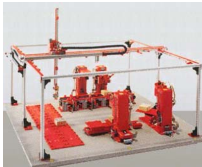
Figure 1. The MOFA educational shop floor

Although there is a lack of measurable evidence on the strengths and weakness of both concepts some issues systematically pop-up during the implementation of distributed control systems for flexible assembly cells. Two installations have been used to test MAS and SOA: the MOFA educational shop floor (Barata et al. 2006a) (Figure 1) and the NOVAFLEX pilot assembly cell (Barata 2003; Barata et al. 2007c; Cândido and Barata 2007; Ribeiro 2007) (Figure 2).