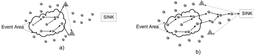
Fig. 2 a) Automated and b) Semi-automated Architecture [5]

directly to the actors, which will efficiently coordinate to execute a specific task without collaboration from the sink. As a result, automated WSN architectures are recommended for time sensitive applications where a fast reaction by the actors is a critical requirement. In the Semi-automated architecture, the sensor data is transmitted to a central controller (e.g. the sink) which will process the collected data and will determine which actors must take action to execute a specific task; this is accomplished by transmitting a set of commands to the corresponding actors.