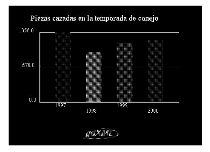
Fig. 2. Example of the resulting image in the navigator