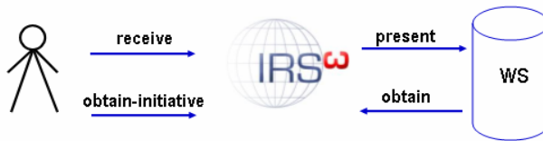
Fig. 1. A typical sequence of choreography events occurring during goal based web service invocation in IRS-III

Figure 1 depicts the event sequence for this typical goal driven web service invocation scenario.