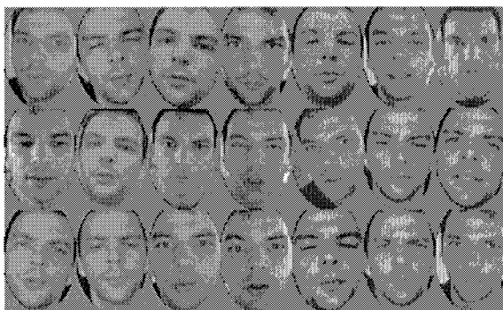
Fig. 1. Effect of 4% RMS eye perturbation on 21 randomly selected HumanScan faces from a single person

The effect of the eye perturbation on the faces is to shift, scale and rotate them in a random manner. Examples of the erroneously registered faces are shown in Fig. 1. While some of them are registered moderately well, there are others where the registration errors have caused only a tilted part of the face to lie in the template or significant background portion to enter the template.