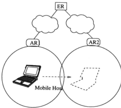
Figure 1. Architecture of mobility.

Each cell of a wireless LAN is managed by an Access Router (AR) that forwards packets between mobile hosts in a cell. Access Routers are interconnected via a wired network and linked to an Edge Router (ER) . There can be some intermediate routers between Access Routers and the Edge Router. For any pair of adjacent cells there is a cross-over router at the intersection of the routes going from Access Routers to the Edge Router. Figure 1 presents the main elements of the architecture.