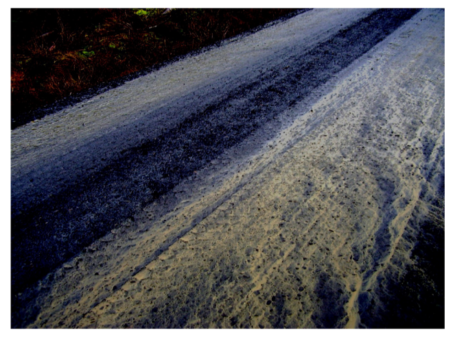
Fig. 3 Erosion from surface material during hauling

Brown et al. [34•] showed the placement of an aggregate surface on a stream crossing resulted in a large reduction in sediment delivered to streams when compared to native soils