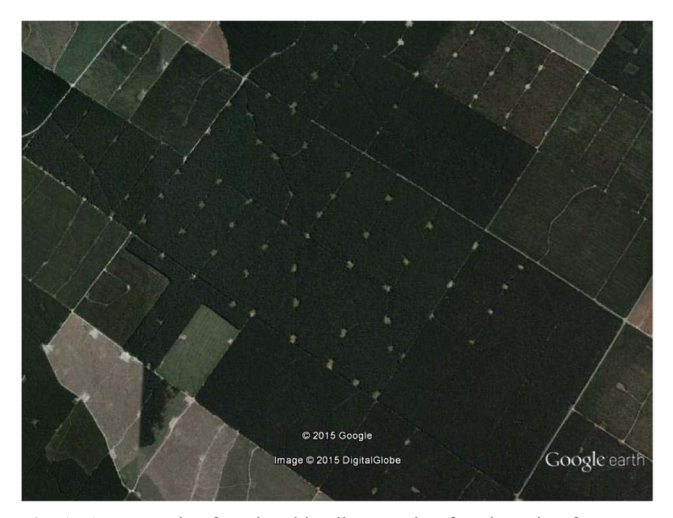
Fig. 1 An example of road and landing spacing for plantation forests on New Zealand's North Island [used with permission via Google's guidelines]

Forest roads may be one of the most used recreational features in a forest. They can facilitate many functions, including providing driving challenges, allowing site seeing, and facilitating an opportunity to observe wildlife or other esthetically pleasing vistas. Roads can also provide access to favorite hunting or camping sites [7]. However, forest roads may need additional care in their design to safely allow for recreational passenger vehicles, which might not be well suited for a forest road designed exclusively for trucks. There can be a