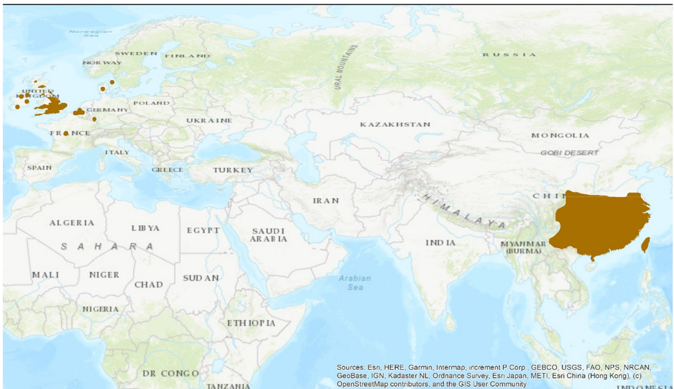
Fig. 1 The global distribution of free-living Reeves’ muntjac to the year 2020 (distribution in Japan not shown). Adapted from Timmins and Chan (2016)

core range in central England and reached the south and east coasts, the ability to expand their range has been limited to the remaining northerly and westerly directions. Moreover, the suitability of land for muntjac is not uniform across the country, potentially becoming less favourable in more northern and western regions (Croft et al. 2019). However, predictions of land favourability for muntjac in Britain have necessarily been based on data recorded across their national range at the time of the study in question and included no information on landcover within their native range. We assumed that landcover in China was likely too different to that of Europe for its inclusion in our predictions of potential spread across