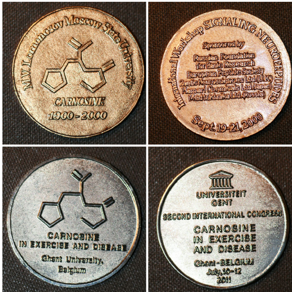
Fig. 1 Pictures of the medals commemorating the first (M.V. Lomonosov Moscow State University, Moscow, Russia; September 19–21, 2000; upper panel) and the second (Ghent University, Ghent, Belgium; July 10–12, 2011; lower panel) International Congress on

Carnosine. New congresses in this series are planned and will be announced on the website of the Carnosine Consortium ( http://users.unimi.it/carnosine_co/ )