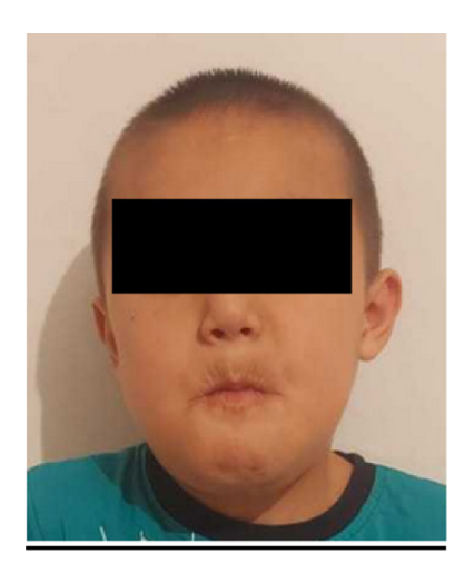
Fig. 3 Image of the patient seven months after treatment

combination of intralesional bleomycin injection and reversible electroporation not only demonstrated a clear sclerosing effect on the malformation but also only low doses of bleomycin were required compared to the usual area of application in chemotherapy. Despite multiple interventions, the cumulative dose of bleomycin of 5 mg remained comparatively low and far below the threshold for systemic lung toxicity. No signs of pulmonary complications attributable to bleomycin and no major complications as defined by the CIRSE classification occurred during the complete course.