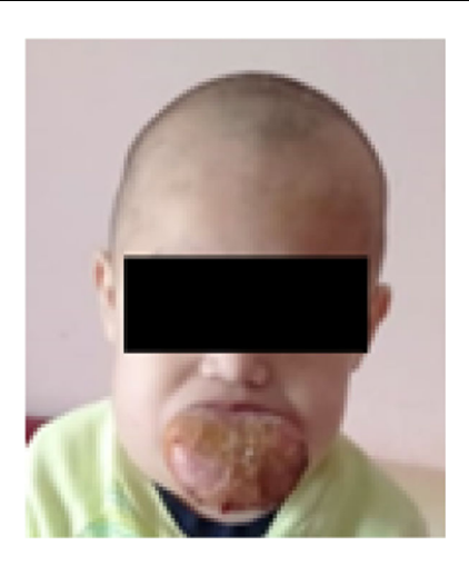
Fig. 1 Image of the patient before the course of treatment

The procedure was conducted under general anesthesia while full thickness excision was performed in a keyhole fashion on the dorsum of the tongue and a "W"-shape on the underside in order to preserve the frenulum [4].