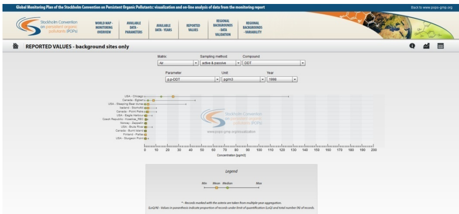
Fig. 2. On-line data visualization of GMP data – tool 4: reported values. Available at www.pops-gmp.org .

The visualization tools were developed using Adobe Flash and ArcGIS technologies. The user-defined outputs are available for download as a graphic file (PNG format); the underlying data from tools 4–6 are also available in text format which is easy to import to MS Excel.