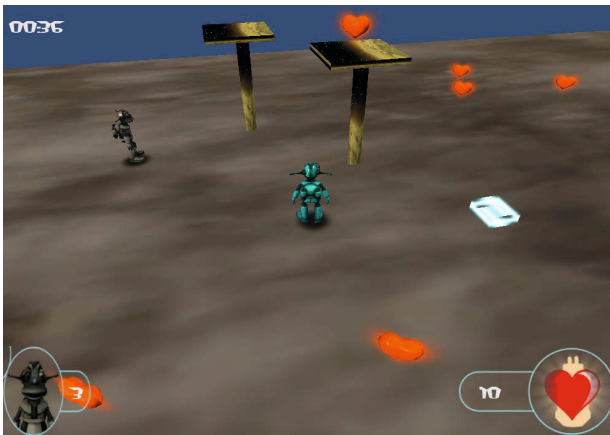
Fig. 1. An example of the game scene

use the jumping pads that help a player to jump higher to collect certain items. In order to get on a different island players need to jump across the abyss. If one of the players falls off the island the team loses one life. In all games players have five lives. After a fall, the player reappears at one of the respawn points. A group score is calculated and analyzed to measure the successfulness of the game completion. All closely-coupled games have equal conditions: players need to pick up 75 objects within 7 minutes. Loosely-coupled games are not designed equally and their play conditions are described further individually. The duration of loosely-coupled games is limited to 5 minutes. The game continues until one of the following conditions is met: (1) players collect all required objects; (2) players lose all their lives; (3) the time runs out.