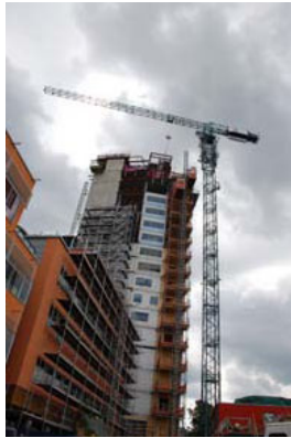
Fig. 1. Tornet (The Tower) during construction

The products which will be included in this study are plasterboards, doors and kitchens. The reasons why these particular products have been chosen are the following: plasterboards are chosen because of the common use of this product in the construction industry. Doors and kitchens are also chosen based on their commonality. Also, they have been subjected to delivery disturbances and quality problems for the examined construction site.