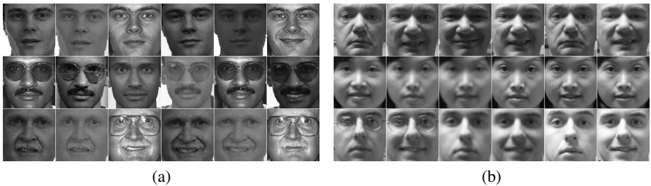
Fig. 1. Face examples of FERET (a) and FRGC (b) databases

The results are reported in terms of three performance indices: rank-1 recognition rate, verification rate (VR) when the false accept rate (FAR) is 0.001, and equal error rate (EER).