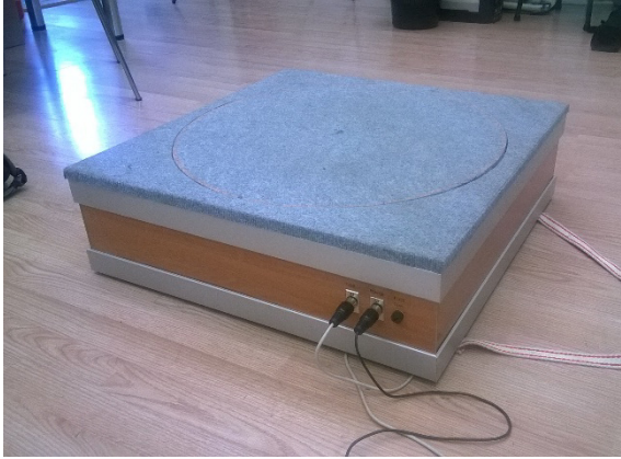
Fig. 2. The Arduino based scan turntable designed and constructed at Biotech Laboratory for 3D body scanning

By using an additional HD camera it is also possible to obtain high definition RGB data for the scene which can be integrated into the 3D model by utilizing UV mapping to provide high definition textures. These HD textures can be stored with the exported surface-reconstructed body model and can later be used for a variety of medical purposes like automatic skin cancer detection. This technology is currently being implemented using Blender scripts.