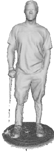
Fig. 3. 3D scanned mesh model of man with a crutch

During testing we used a volumetric model constructed from 512 \times 512 \times 512 voxels and a model resolution of 256 voxels/meter. Using the same settings on a high-end desktop PC we were able to process 30 depth frames/second allowing real-time reconstruction. We also tested different indoor lighting and camera setups, including stationary and dynamically moving Kinect sensors. While we found the reconstruction algorithms to be more robust by using a stationary sensor and the turntable, illumination only affected the quality of the RGB colors and captured textures, but not the quality of the mesh models.