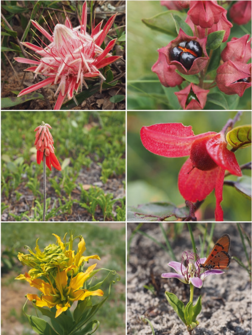
Fig. 5.3 Some plants collected during recent fieldwork in central and eastern Angola as part of the National Geographic Okavango Wilderness Project. Top to bottom, left to right: Protea poggei subsp. haemantha (Proteaceae); Clerodendrum baumii (Lamiaceae); Erythrina baumii (Leguminosae); Monotes gossweileri (Dipterocarpaceae); Gloriosa sessiliflora (Colchicaceae); Raphionacme michelii (Apocynaceae).