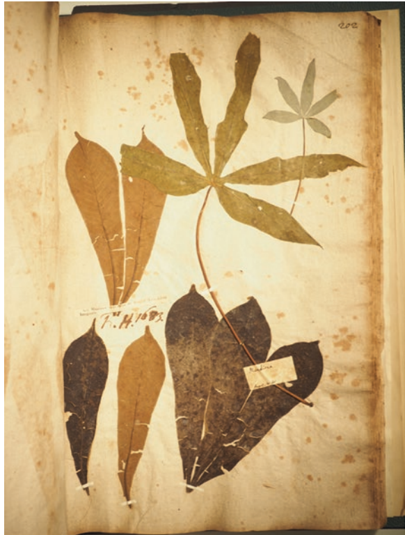
Fig. 5.1 One of the earliest herbarium specimens collected in Angola, in 1706 or 1707, by W Browne and now housed in the Sloane Herbarium at the Natural History Museum in London. The New World starch crop – cassava Manihot esculenta (Euphorbiaceae)

Mendonça (1962) presents a historical account of plant collectors in Angola, giving helpful insights to the itineraries of a number of early expeditions. A more complete list of collectors is given by Figueiredo et al. (2008), which volume also includes a useful listing of references relevant to the study of the flora of Angola.