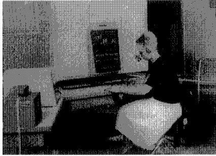
Figure 1. The D2 desktop computer

was a prototype, one of the first transistorized computers in the world, called D2, which he demonstrated to the Swedish air force in 1960. It was a desktop computer; in fact, it covered the entire desktop. See Figure 1.