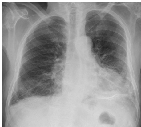
Fig. 1 Chest x-ray: bilateral, diffused interstitial opacities in lower lobes, especially by the left side

CRP C-reactive protein, PCT procalcitonin, WBC white blood cell count, Lymph. lymphocyte count, Neutr. neutrophil count, RBC red blood cell count, HGB hemoglobin, PLT platelets count, AlAt alanine aminotransferase, AspAt aspartate aminotransferase, GLUC glucose concentration, CREA creatinine, D-dimer fibrin degradation product, IL-6 interleukin 6