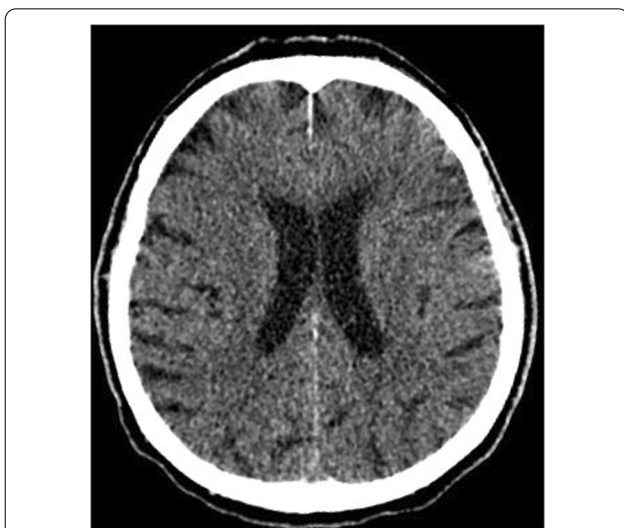
Fig. 3 Brain computed tomography (axial scan): no evidence of intracranial hemorrhage. Features of leukoaraiosis. Ventricles of normal volume. Brain structures without displacement. Skull bones in the study area without traumatic injuries

for 25.1–41.2% of meningitis cases among all age groups. This clinical manifestation of bacterial infection is burdened with high mortality. Early diagnosis and the initiation of therapy significantly affect the course of the disease. Untreated properly, can be fatal in most cases [4].