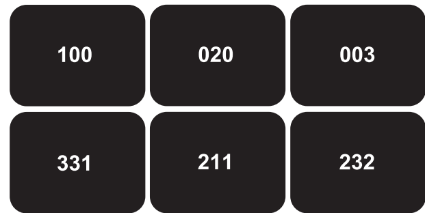
Fig. 1 The objective during the multi-source interference task was to report, via button-press, the identity of the displayed number that differed from the other two numbers. During the control tasks (upper row), the distractors were zeros, and the target numbers (either 1, 2, or 3) were always placed congruently with their position. During the interference tasks (lower row), the distractors were either 1, 2, or 3, and the target numbers were never placed congruently with their position. The correct answer for the first column is hence '1', for the second '2', and for the third '3'

The MSIT was executed in concordance with the instructions of Bush et al. [15]. In short, the subjects were given an